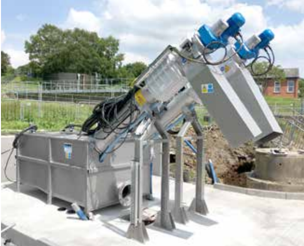
Two HUBER Micro Strainers ROTAMAT® Ro9 in one container. Designed for machine redundancy.