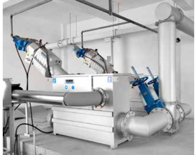
Tank installation of a HUBER Micro Strainer ROTAMAT® Ro9.