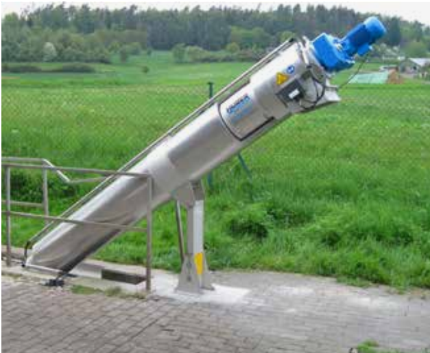
Outdoor installation of a HUBER Micro Strainer ROTAMAT® Ro9.