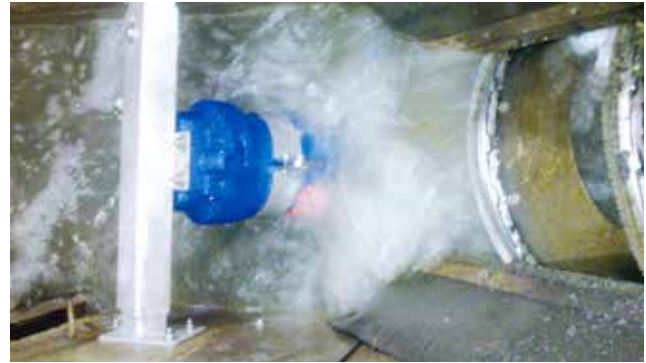
External screenings washing system (ERGA). A preceding washing system washes out the organic matter.