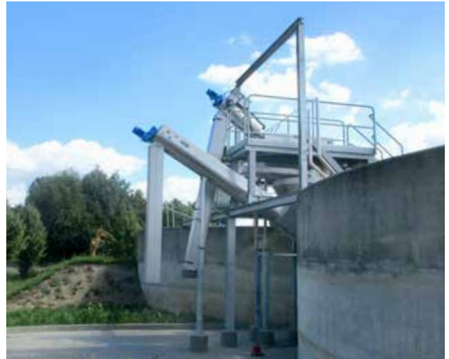
Compact plant designed with a ROTAMAT® Ro9 pre-screening.