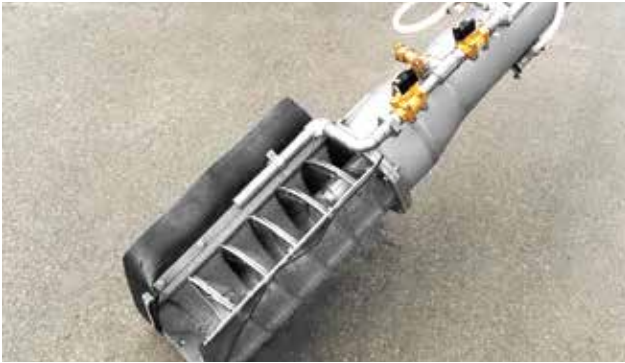
Integrated screenings washing system (IRGA). The ROTAMAT® principle allows for integration of the screenings washing system directly in the lower end of the rising pipe.