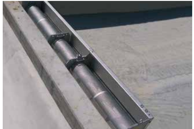
HUBER Storm Screen ROTAMAT® RoK2 after completed installation.