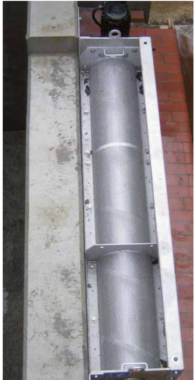
HUBER Storm Screen ROTAMAT® RoK2 installed at a stormwater discharge.

HUBER Storm Screen ROTAMAT® RoK2 screens are horizontally installed at the upstream side of overflow weirs. A screw flight is mounted on a half cylinder of perforated plate. As the stormwater flows through the horizontal perforated half-pipe of the screen trough the solids are retained. A screw, with a brush attached on its flights, rotates within the semi-circular screen trough. It cleans the screen and pushes the separated solids gently towards the lateral discharge. The screenings remain on the polluted water side of the screen from where they are taken along with the wastewater flow. During storm conditions the screen is automatically started and then works fully automatically.