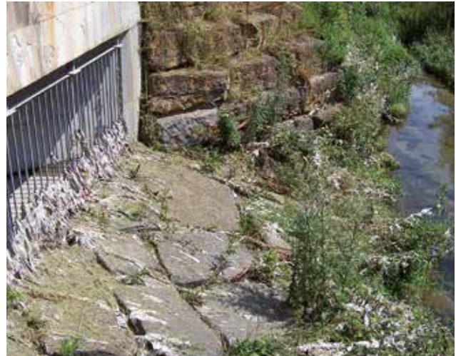
Unsightly matter discharged during storm events, typical for stormwater discharges without coarse material retention.

The polluting items, such as sanitary products, toilet paper, faeces, plastic foils, etc. are not only unsightly but also responsible for considerable cleaning and/or disposal costs. On the basis of the DWA sheet A 102 (an instruction issued by an association dealing with wastewater treatment) efforts to fundamentally improve the protection of waters in this sector have been increased. Particularly endangered receiving water courses and nature preservation areas require more extensive measures concerning the treatment of stormwater.