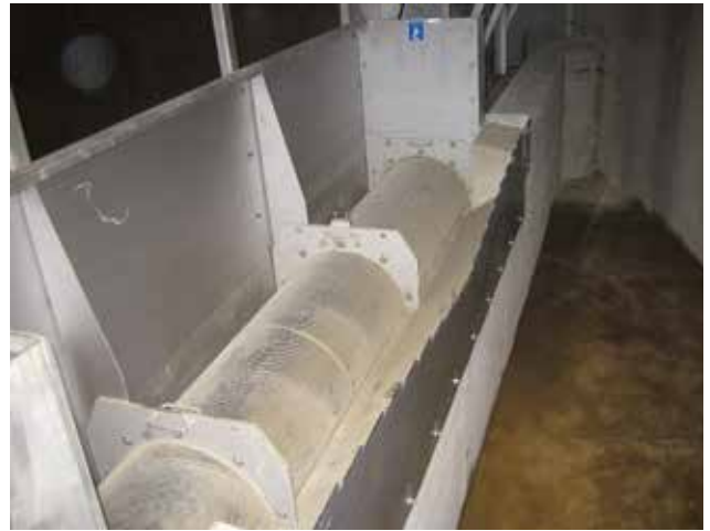
HUBER Storm Screen ROTAMAT® RoK2 with an integrated gauging weir for overflow measurement.