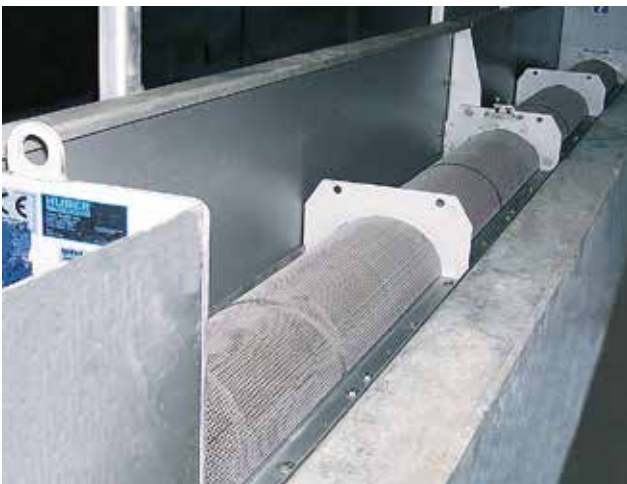
View of the downstream side of a HUBER Storm Screen ROTAMAT® RoK2.