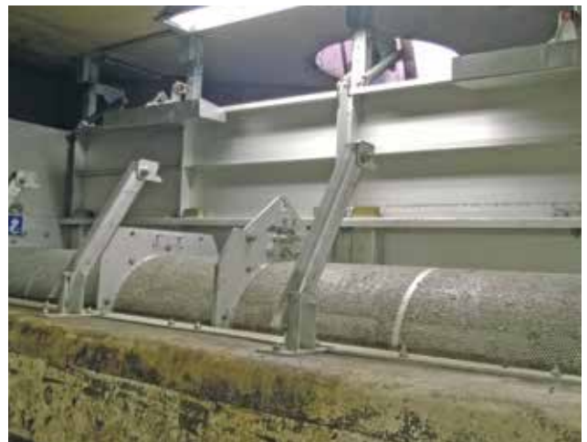
HUBER Storm Screen ROTAMAT® RoK 2 – Optional version with emergency overflow.