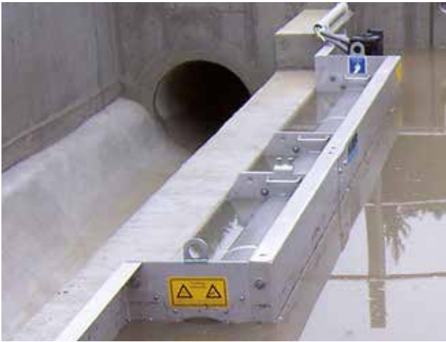
HUBER Storm Screen ROTAMAT® RoK2 before overflow.

A selection of installation examples will convince you of the HUBER Storm Screen ROTAMAT® RoK2