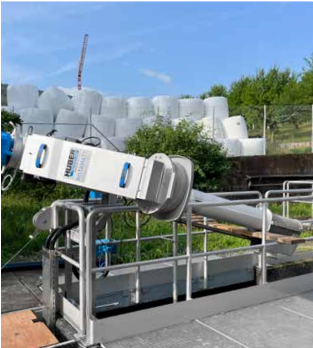
"Quick swing-out system" with cable pull for easy maintenance access outside a channel installation situation.