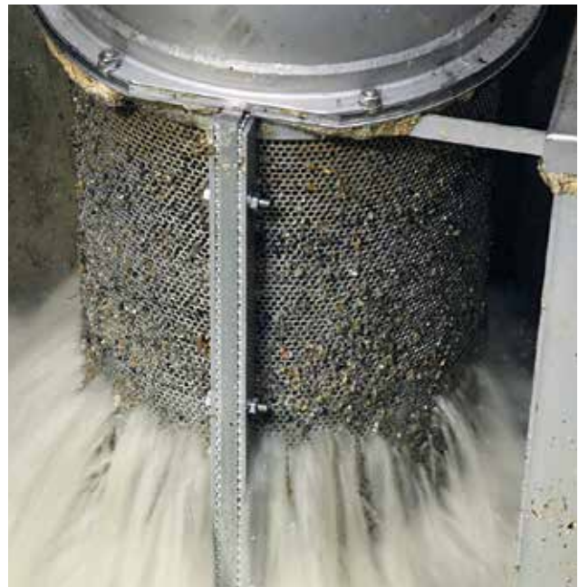
HUBER Pumping Stations Screen ROTAMAT® RoK4 in operation.