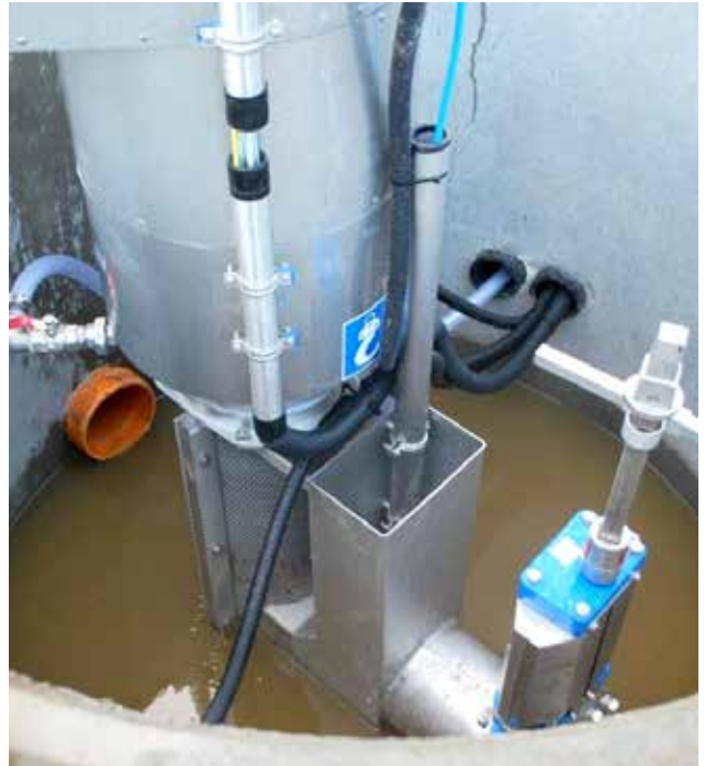
View of the screen basket in operation.