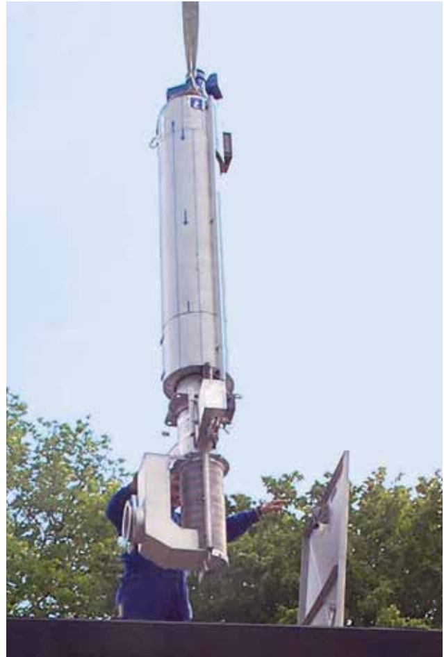
HUBER Pumping Stations Screen ROTAMAT® RoK4 being lifted into a pumping station.