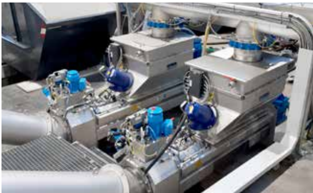
Maximum washing and dewatering results with the HUBER Screenings Wash Press WAP® SL HP.

For an optimised maintenance strategy, the machines are equipped with wear detection of the compacting screw in the press zone. The system automatically detects the ideal time for maintenance of the auger.