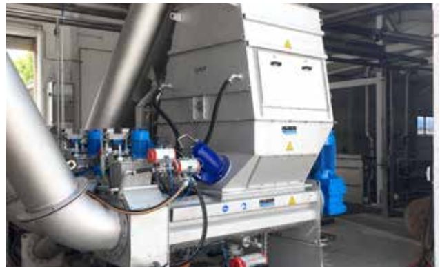
The hydraulic high-pressure unit at the end of the wash press guarantees a maximum DR.