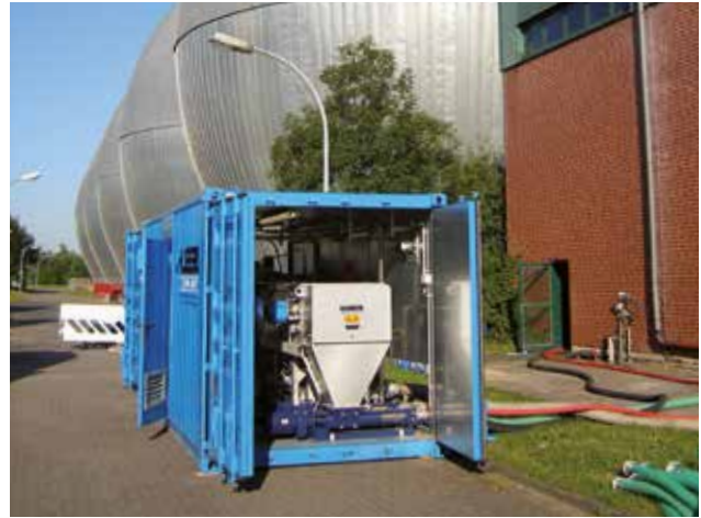
Mobile containerised demo unit.