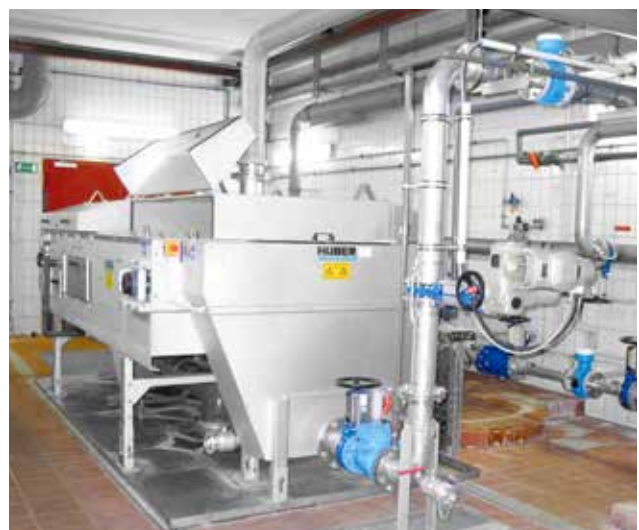
HUBER Belt Thickener DrainBelt for 60 m 3 thin sludge per hour.