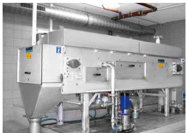
Belt washing with filtrate water as spray water.