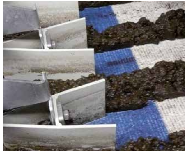
Chicanes furrow the sludge to facilitate drainage and support the production of a concentrated sludge cake.