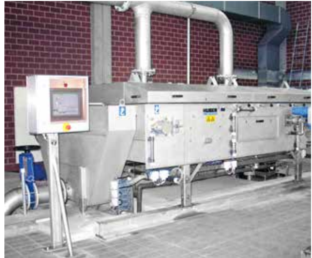
HUBER Belt Thickener DrainBelt for up to 100 m 3 /h thin sludge.