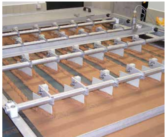
Thickening of dairy sludge.