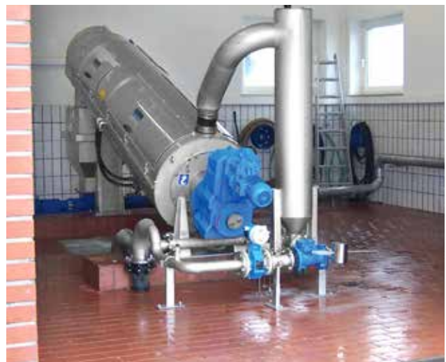
HUBER Screw Press S-PRESS for 8 m 3 /h.