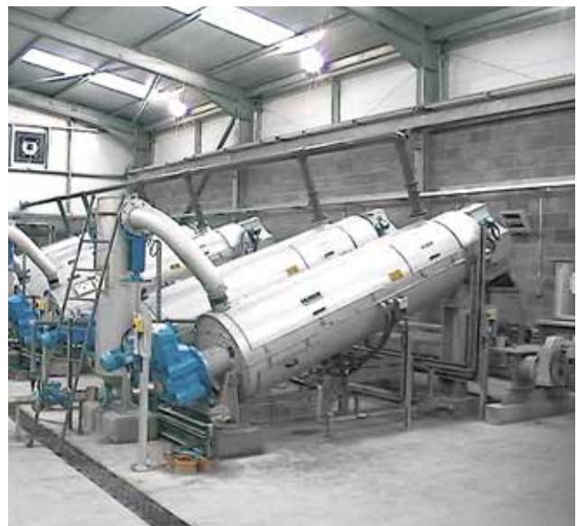
Parallel installation of six HUBER Screw Press S-PRESS units.