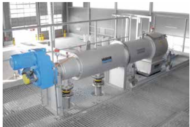
HUBER Sludgecleaner STRAINPRESS® applied for fermentation residue screening.