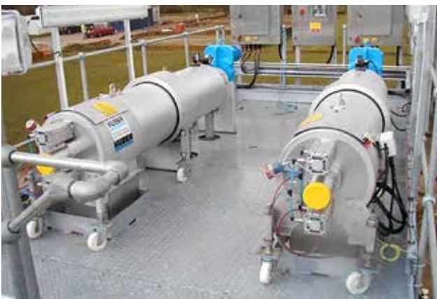
STRAINPRESS® with heatable casing pipe.