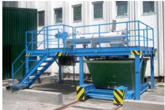
Outdoor installation of a HUBER Sludgecleaner STRAINPRESS® 290.