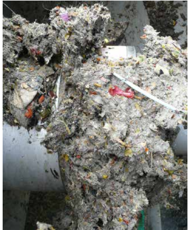
Discharge of the separated dewatered material.