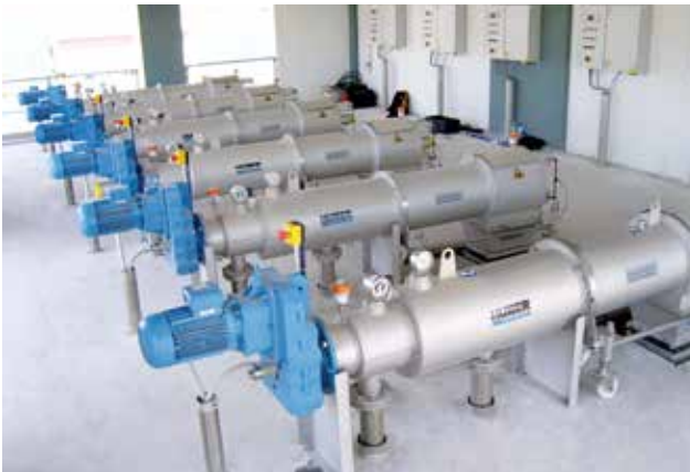
Sludge screening on a large sewage treatment plant.