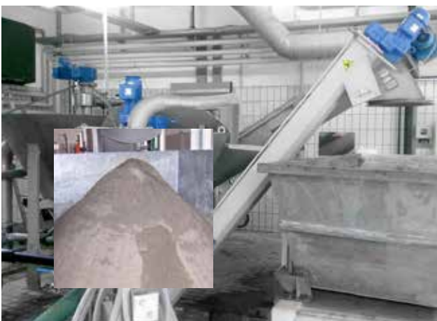
Grit washer installation on a municipal sewage treatment plant.