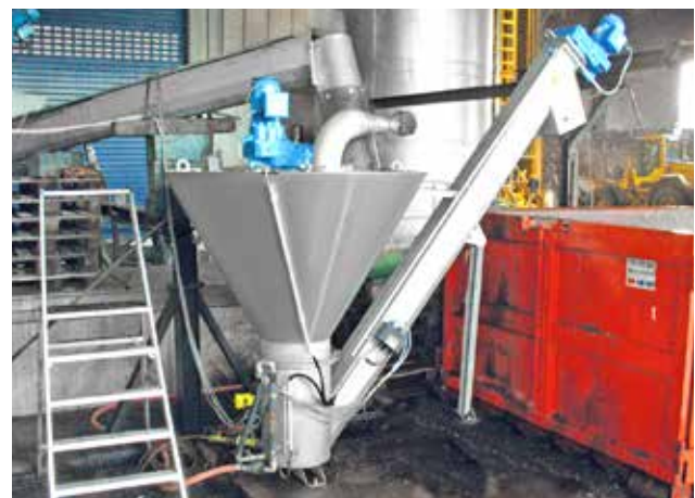
Special design for the treatment of sediments from biogas plants.