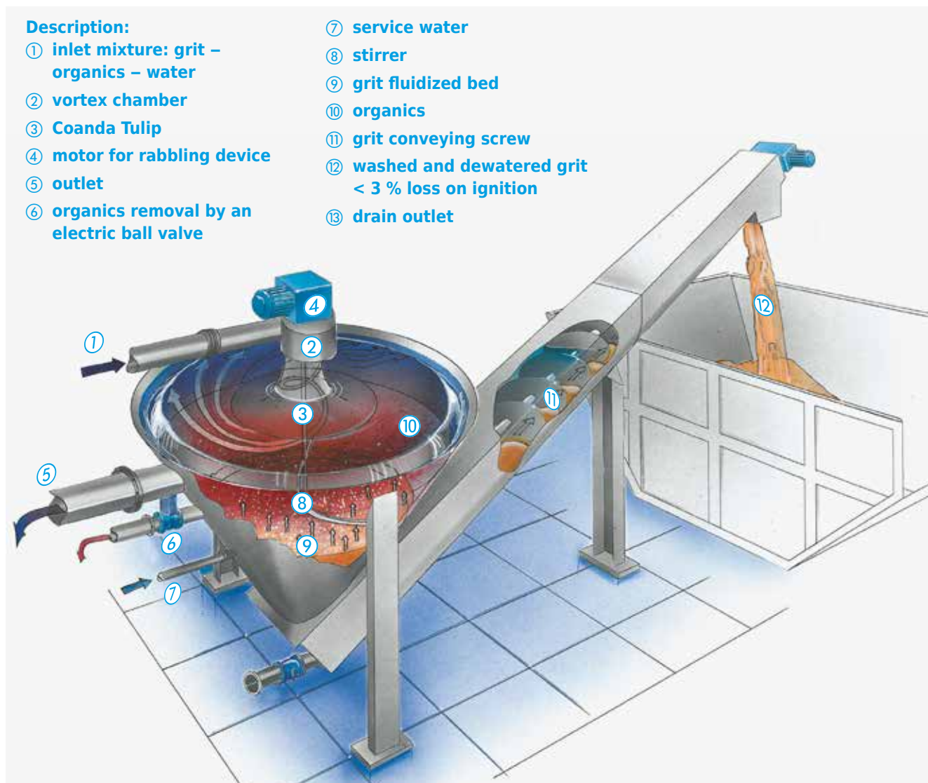
Flow diagram of a HUBER Coanda Grit Washer RoSF4.

This results in inevitably high costs for dewatering, removal, transport and disposal.