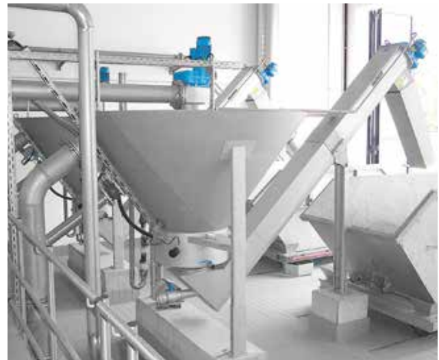
Reduced disposal costs and improved hygienic conditions with the HUBER Coanda Grit Washer RoSF4.