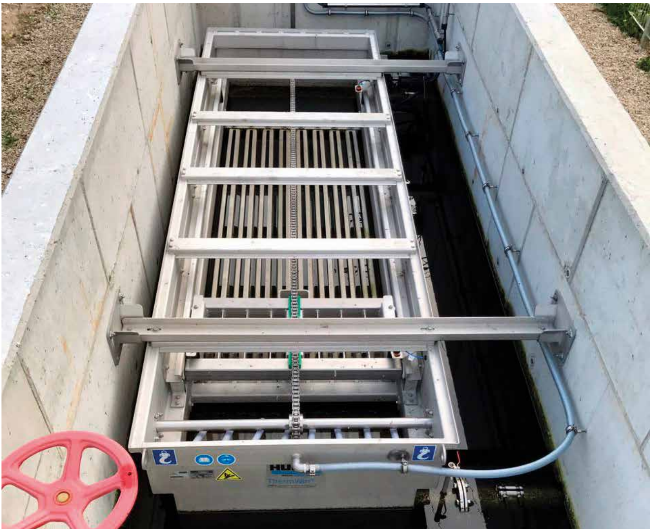
HUBER Heat Exchanger RoWin C installed in a concrete tank. The flow streams through the heat exchanger by gravity.

pumping energy is required. This avoids costs and significantly improves the economic efficiency of such plants. The HUBER Heat Exchanger RoWin C can make an important contribution especially to energy-efficient retrofitting of sewage treatment plants. Due to its compact design and installation in a channel or tank, no additional installation space is required and the available space utilised at an optimum. But biofilm growing on the heat exchanger surfaces cannot completely be ruled out with the use of the WWTP effluent. Integrated cleaning of the heat transfer surfaces therefore is of great importance to continuously maintain the maximum heat transfer capacity. Several HUBER Heat Exchanger RoWin units can be installed in parallel or in series for perfect adjustment to specific site conditions and customer requirements. Combined with load-bearing covers the units can also be installed under parking areas for example.