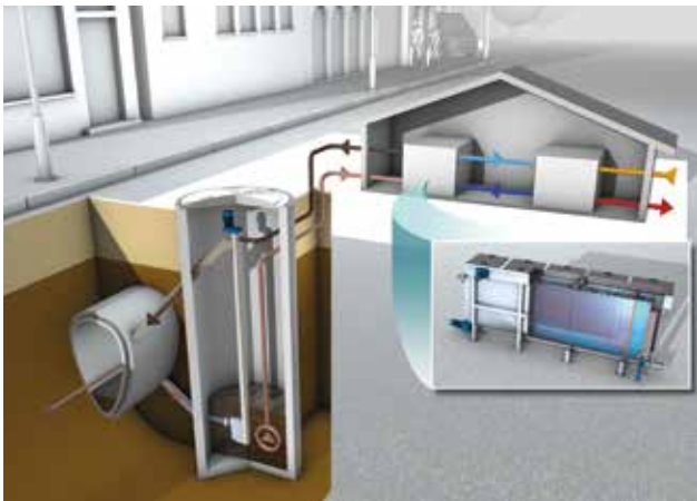
Eco-friendly heat supply for buildings: HUBER ThermWin system with HUBER Heat Exchanger RoWin.