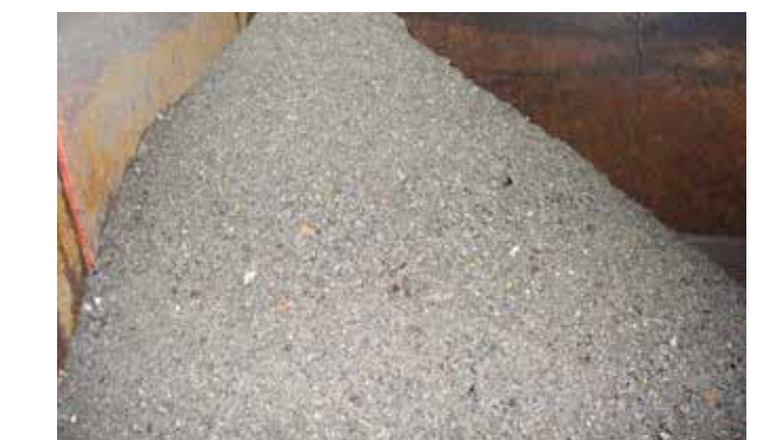
The product discharged from the HUBER Grit Washing Plant RoSF G4E Bio: washed mineral material.

The organic matter adhering to the contaminants is recovered by the HUBER Grit Washing Plant RoSF G4E Bio (No. 3) and is then returned to the biogas production process. The washed materials can be profitably sold for recultivation, for example. In addition, the integrated dewatering unit significantly reduces material transport costs.