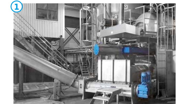
HUBER Wash Press WAP®.

The HUBER Wash Press WAP® (No. 1) recovers the organic matter adhering to the coarse material and returns it to the suspension. In addition, the HUBER Wash Press WAP® compacts the coarse materials, which can thus be disposed of at lower cost.