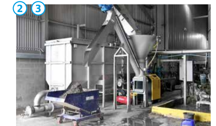
HUBER Longitudinal Grit Trap ROTAMAT® Ro6 Bio and HUBER Grit Washing Plant RoSF G4E Bio.

Furthermore, the compact HUBER Longitudinal Grit Trap is easy to integrate into the existing pipeline.