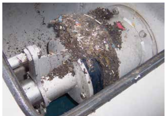
Separated and dewatered foreign matter from the HUBER STRAINPRESS® at a biological waste treatment plant in Germany.