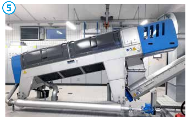
HUBER Screw Press Q-PRESS®.

The HUBER Screw Press Q-PRESS® (No. 5) dewateres the fermentation residue and reduces storage and transport costs to a minimum. The fully automatic screw drive is characterised by very low speed, highest energy efficiency and minimum maintenance.