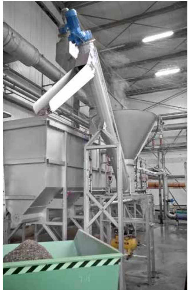
HUBER Grit Washing Plant RoSF G4E Bio at a German biowaste treatment plant.