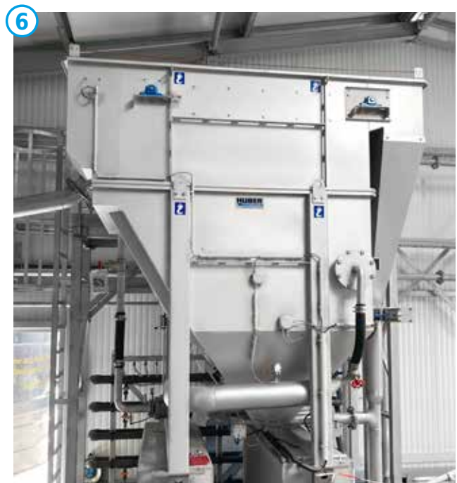
HUBER Dissolved Air Flotation Plant HDF.

The flotation sludge from the dissolved air flotation plant contains valuable organic substances that can be reused for biogas production.