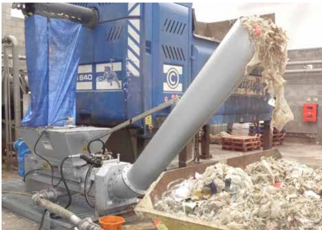
HUBER Wash Press WAP® at an English biowaste treatment plant.