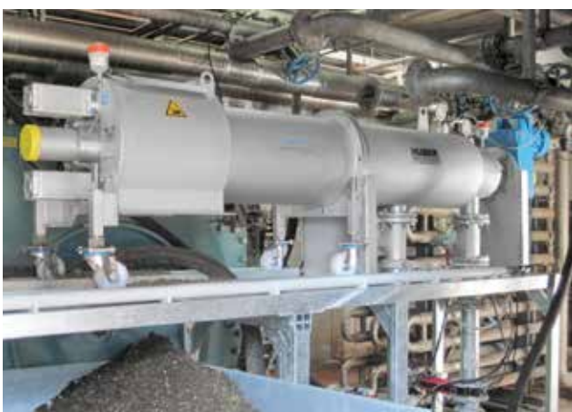
HUBER Sludge Cleaner STRAINPRESS® integrated into the pipeline (Great Britain).