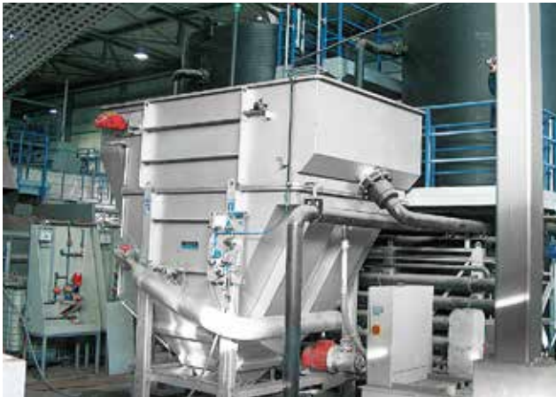
HUBER Dissolved Air Flotation HDF at a food waste treatment plant in Spain.

More than 60 reference installations in (bio-)waste treatment worldwide: