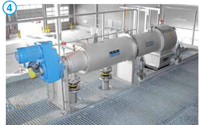
HUBER Sludge Cleaner STRAINPRESS®.

However, legal requirements have to be met so that the fermentation product can be spread on agricultural land, for example. The solution to this is the HUBER Sludge Cleaner STRAINPRESS® (No. 4), which specifically separates foreign materials such as plastic particles and at the same time dewater them, thus reducing costs.