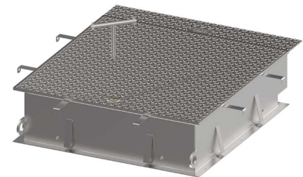
HUBER Manhole Cover SD7 RC4.