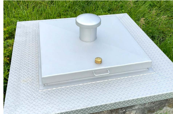
HUBER Manhole Cover SD3. Optional accessories available.