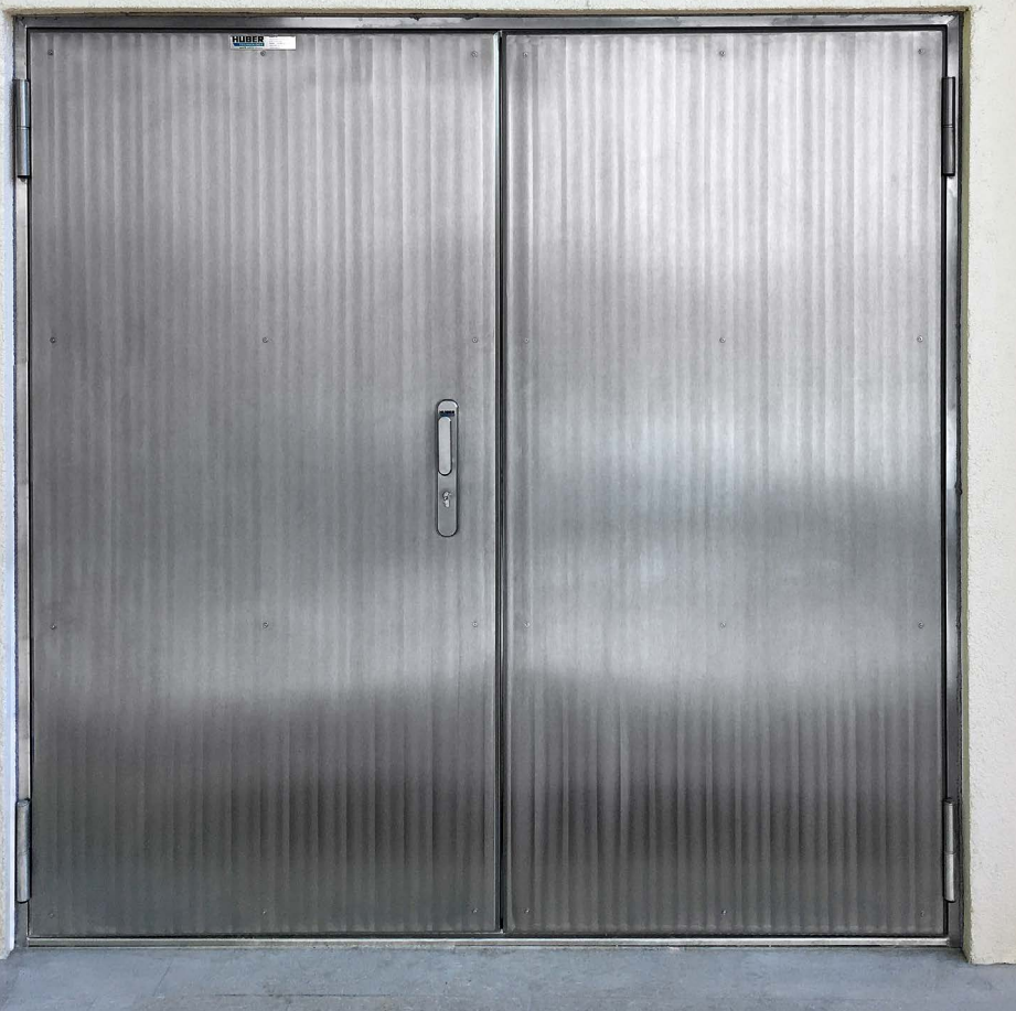
HUBER Security Door TT2. Optional accessories available.