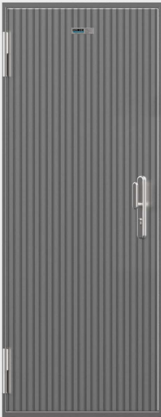
HUBER Security Door TT2.1 RC3.

High-quality materials, sophisticated security mechanisms and versatile customisation options offer optimum protection and durability. A first-class choice for demanding security requirements.