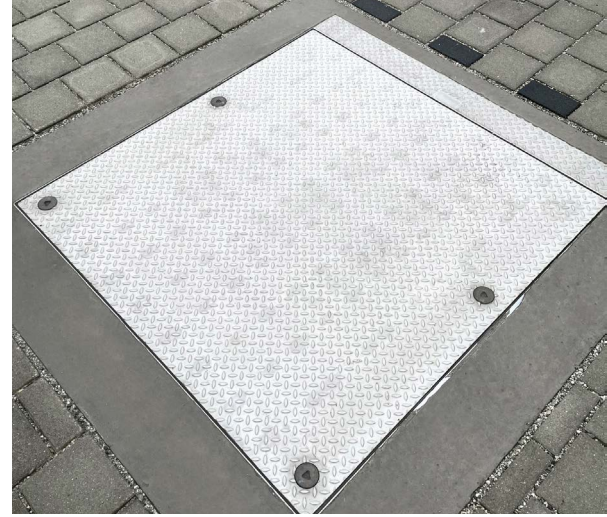
HUBER Manhole Cover SD7. Optional accessories available.