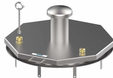
HUBER Manhole Cover SD3 RC3.