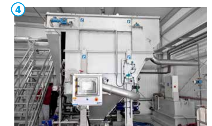
HUBER Dissolved Air Flotation Plant HDF.

The innovative HUBER Chemical Dosing DIGIT-DOSE system reduces precipitant consumption – and thus operating costs for the flotation plant and disposal costs for the flotation sludge – to a minimum.