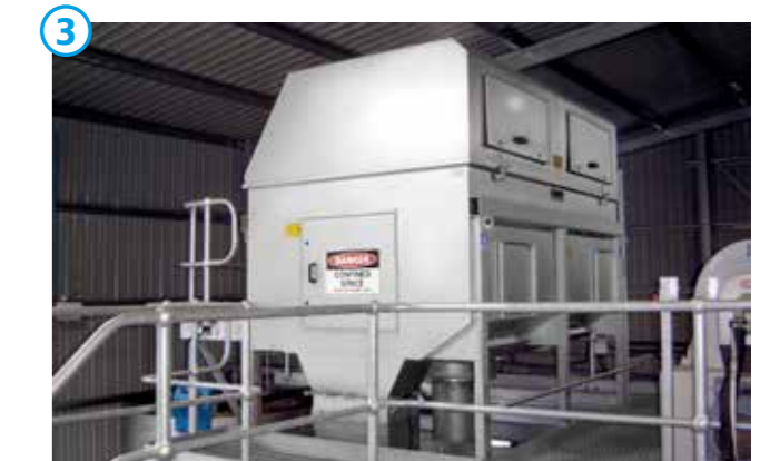
HUBER Drum Screen RoMesh®.

The integrated high-pressure cleaning nozzle (120 bar) ensures trouble-free operation. In addition, service water consumption is reduced to a minimum through internal wash water circulation. Furthermore, the HUBER Drum Screen RoMesh® is characterised by its enclosed and compact design.