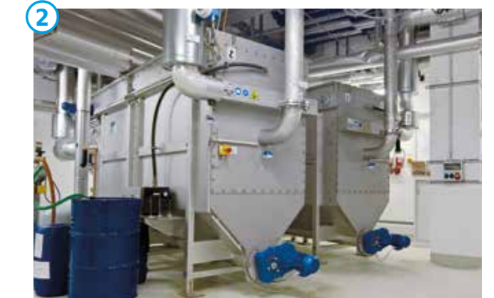
HUBER Heat Exchanger RoWin.

The modular HUBER Heat Exchanger RoWin is specially designed for the highly loaded hot wash water streams from the plastics recycling process. Due to its integrated, fully automated self-cleaning system, the heat transfer surfaces are kept free and maximum energy transfer is continuously ensured. The recovered energy is available free of charge for reuse in the plastics recycling process or for heating the factory buildings. The wastewater heat exchanger can be installed either in the tank or in the channel.