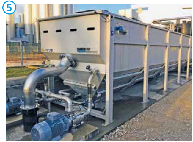
HUBER Dissolved Air Flotation Plant HDF S.

The HUBER Chemicals Dosing DIGIT-DOSE system reduces investment, operating and disposal costs to a minimum.