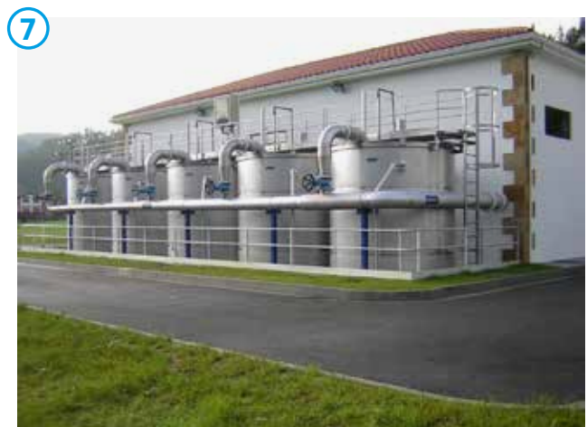
HUBER CONTIFLOW® sand and activated carbon filter.

One variant is the reliable retention of filterable substances in the HUBER Sandfilter CONTIFLOW® and the subsequent elimination of trace substances and dissolved COD compounds by adsorption in the HUBER Activated Carbon Filter CONTIFLOW GAK.