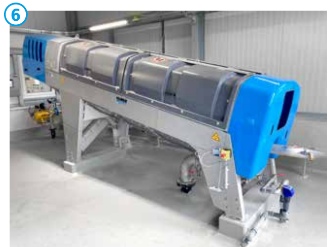
HUBER Screw Press Q-PRESS®.

An innovative control system enables unattended operation even with fluctuating sludge properties.