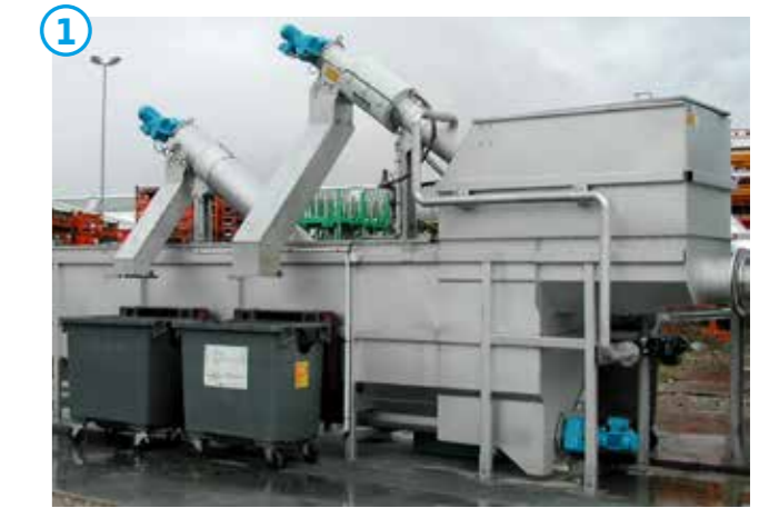
HUBER Complete Plant ROTAMAT® Ro5.

The multifunctional Complete Plant is a completely encapsulated, odour-free system and can be installed above or below ground.