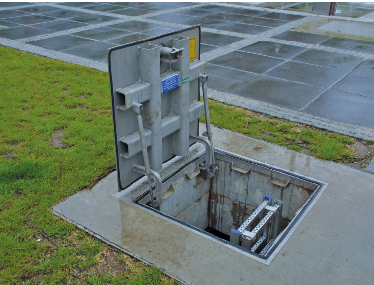
The figure shown here may contain special accessories.

Insertable entrance aid , with design certification in accordance with DIN 19572, made of 1.4307 (AISI 304 L) stainless steel, for safety access ladders with 300 mm, 400 mm, 500 mm width.