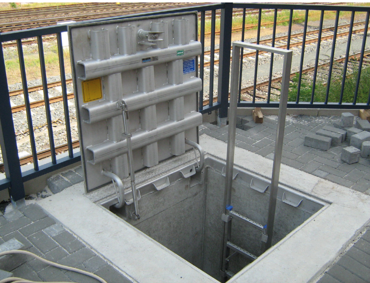
The figure shown here may contain special accessories.

Collapsible hand post with double handle, with design certification in accordance with DIN 19572, made of 1.4307 (AISI 304 L) stainless steel, for safety access ladders with 300 mm, 400 mm, 500 mm width, for ladder lengths from 2010 mm. Overall length: 1800 mm.