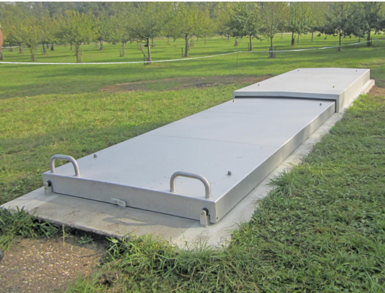
The figure shown here may contain special accessories.

Sliding hatch cover , completely made of 1.4307 (AISI 304 L) stainless steel, with smooth finish.