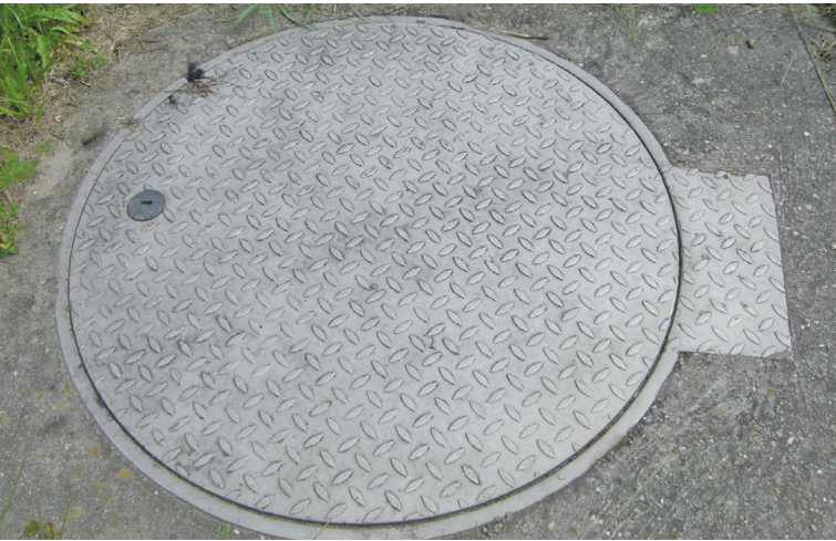
The figure shown here may contain special accessories.

Manhole cover , installed flush with the surface for pedestrian and/or vehicle traffic, optionally in class A15, B125, D400 or E600, weatherproof, odour-tight against pressureless water, attack-proof, round in shape, made of 1.4307 (AISI 304 L) stainless steel.