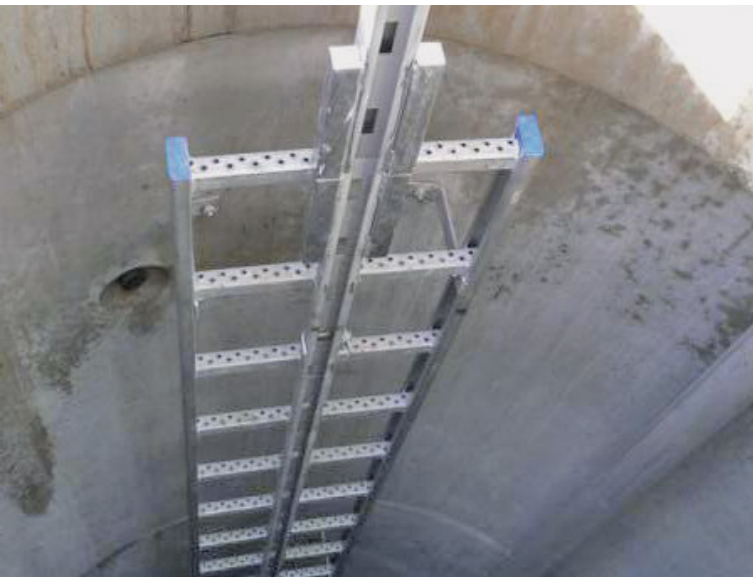
The figure shown here may contain special accessories.

Safety access ladder with guard rail, with design certification and CE marking; according to UVV regulations ladders with 3 m or 5 m height of fall must be equipped with devices that protect personnel against falls from a height; in accordance with DIN EN 14396, made of 1.4307 (AISI 304 L) stainless steel, designed to attach an insertable entrance aid.