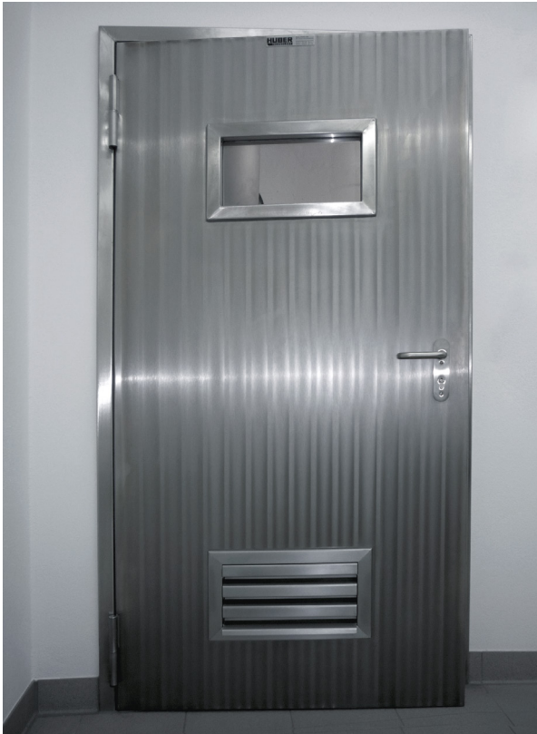
The figure shown here may contain special accessories.

Access door for buildings in the field of potable water supply and wastewater disposal with average security requirements.