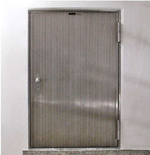
The figure shown here may contain special accessories.

Door , ready for installation, single door, double skinned, completely made from 1.4404 stainless steel (AISI 316 L), with double rubber seal, the door and frame closing flush, the door opening to the outside (in escape direction).