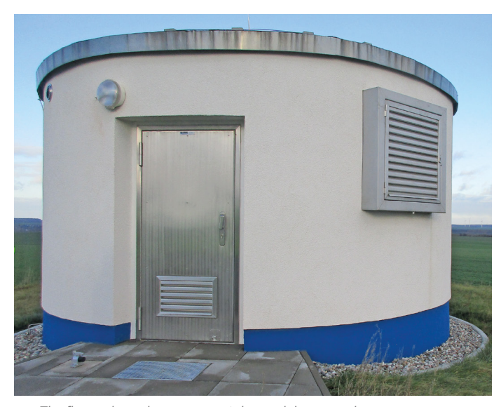
The figure shown here may contain special accessories.

Access door for buildings in the field of potable water supply equipped with a burglar alarm system.