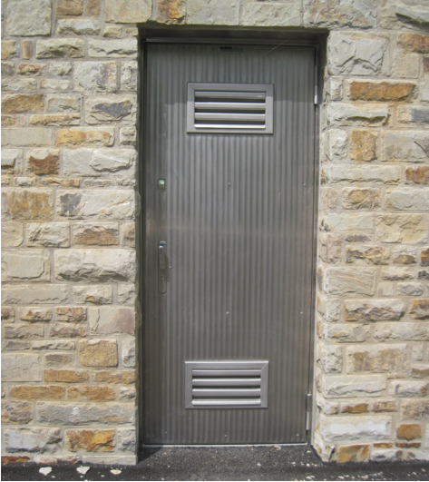
The figure shown here may contain special accessories.

Access door for buildings in the field of potable water supply without a burglar alarm system.