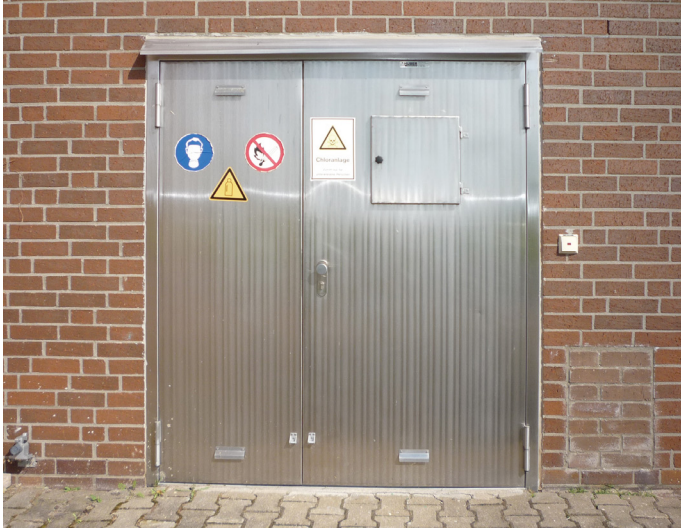
The figure shown here may contain special accessories.

Access door for buildings in potable water supply where chlorine gas is stored or used.