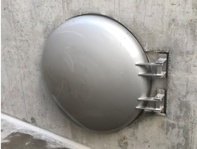
The figure shown here may contain special accessories.

Access door for containers, especially in the field of potable water supply, pressure-tight up to a water gauge of 10 m.