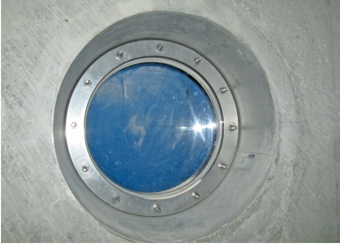
The figure shown here may contain special accessories.

Sight glass in the bottom of water tanks, pressure-tight up to a water gauge of 10 m.